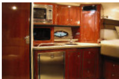
The exterior appeal carries to the cabin where the cabinetry and stainless appliances offer style.

The 340 has the genes of those centerfold-worthy boats, including the high energy that pervades the entire Crownline company. The difference is this boat is nearly eight feet longer than Crownline's largest boat of a year ago.